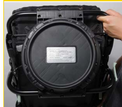
The Product Information Label is located on the bottom of the Stroller Seat Hub